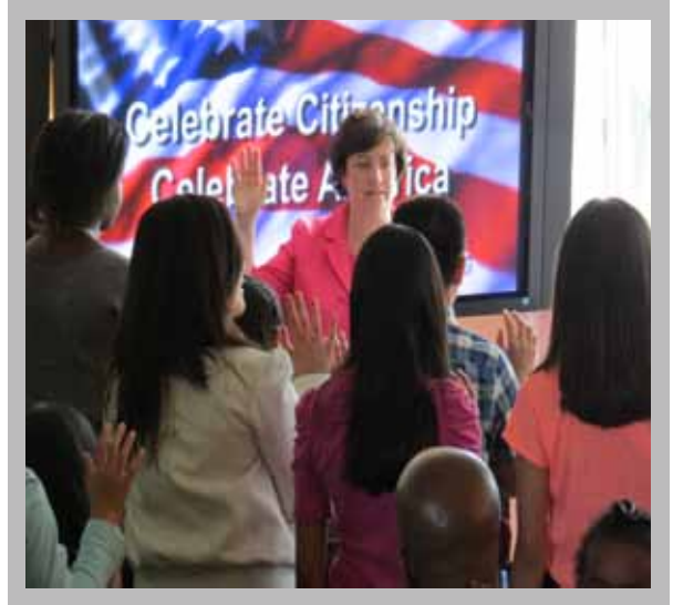
On April 24, 2012, we hosted our first Naturalization Ceremony at President Lincoln's Cottage. Twenty one children from sixteen countries were sworn in as United States citizens during this special ceremony in the Emancipation Room.