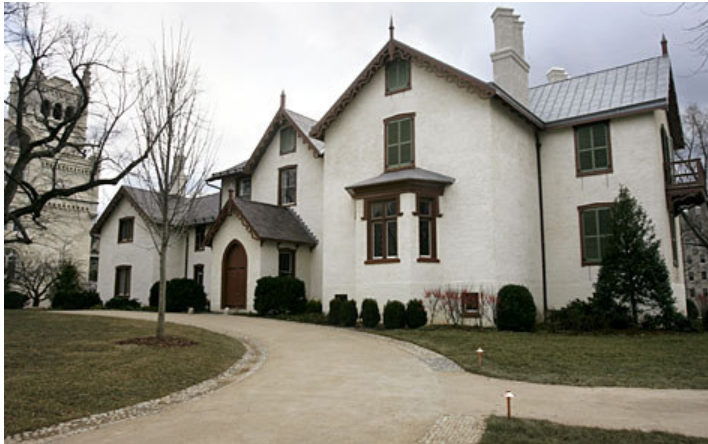
President Lincoln's Cottage, modern day.