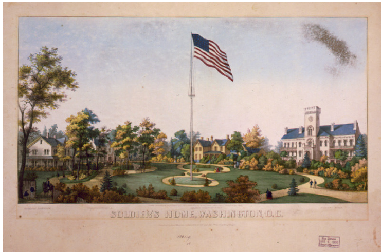
A wartime image of the Soldiers' Home (far right) and its adjacent cottages, published by popular printmaker Charles Magnus.