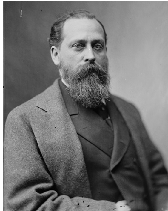
Confederate veteran Alfred Wardell led the overthrow of Wilmington's (N.C.) integrated city government in 1898.

supporting this; they literally didn't stop the overthrow of democratically elected governments. In that case, who does it mean actually won?