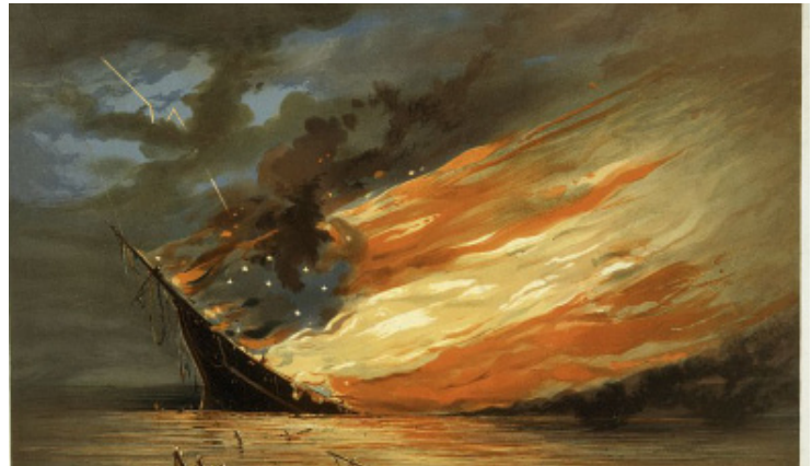
"Fate of the Rebel Flag" by William Baully.

problems. That flag was just a symbol of what the problems are. In an ironic way I think the heritage people have a point in that it is just a symbol that means bad things to a large group of people, but it doesn't address the racism and white supremacy that has gone on in America for a long time and continues.