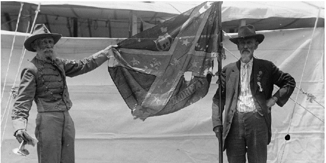
Confederate veterans' reunion in 1917.

VB: I think that we need to deal with the history of White Supremacy, what it's meant. We need to do that in history courses. We need to do that in terms of the horrors of our history, the sort of violent over throws of democratic governments. We're coming up on [the sesquicentennial anniversary] of Reconstruction. People argue that the identity of America is found in the Civil War. And yet I think what we became is in fact hammered out during Reconstruction. As I've argued you cannot separate one from the other. I hope we can use that as an opportunity to reconsider what Reconstruction was, what it meant,