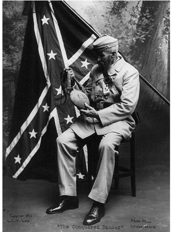
Confederate veteran c. 1913.

Vernon Burton: When they asked me about the flag coming down I said I was not as optimistic as most people were. I actually thought it might not come down. It's something I had hoped for my whole life just about. I think I certainly was surprised. I think the difference, the real difference, wasn't so much outside forces or so much the influence of Governor Nikki Haley, or from business. But I really think it ironically was really part of Southern Heritage. We're so used to seeing the bad side of Southern Heritage with waving the flag and what it means.... But when the victims' families spoke about grace, forgiveness, for this horrible, horrible murder, and asking God to forgive him. And President Obama reflected those words when he gave his speech.... If you listened on both sides of the aisle,