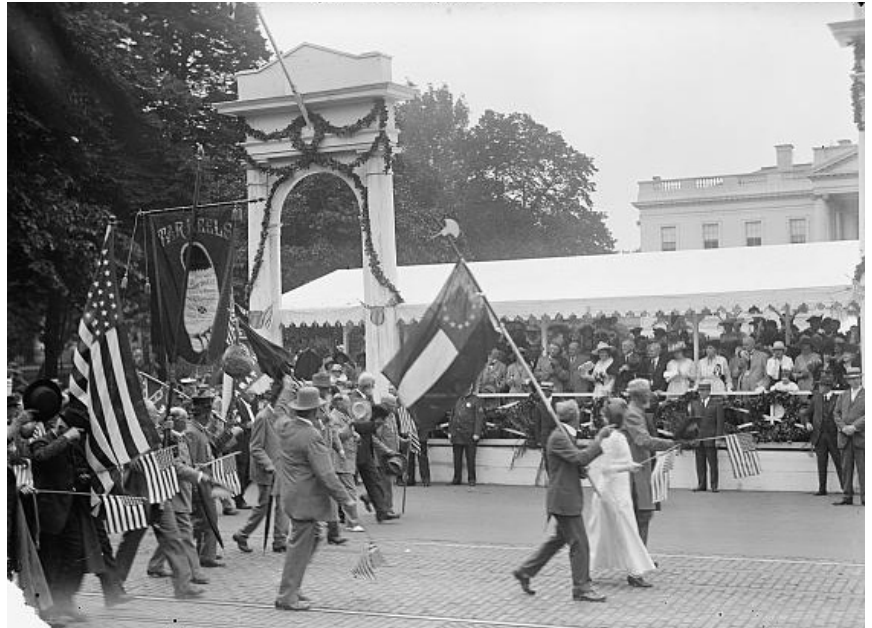
Confederate reunion rally outside the White House in 1917.

EM: I think it does show that there has been some change, but I think this movement that we're seeing at the moment, I'm afraid it's not permanent. That's the big issue for me. I'm afraid people saw it as the right thing to do because the shooting was so horrific. But people will forget and go back to where we were. It's the underlying issues. That flag represents oppression [and] hate. It represents a heritage based, at