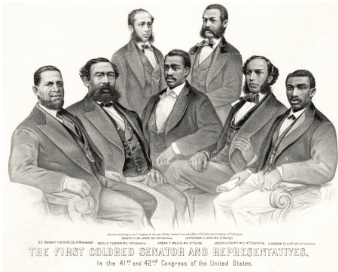
First black Congressmen during Reconstruction, including Reps. Robert Elliott and Robert DeLarge of South Carolina. Image from the Library of Congress

We also need to deal with the real issues. The flag is a symbol, but it's what's underneath that really matters. How do we get to that very difficult place that we can get people to recognize what that flag