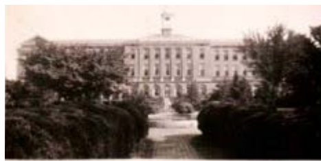
The old barracks and hospital building of the Armed Forces Retirement Home.

I knew very little about them. It was a good section of town where ordinary folks lived and they never gave us any problems. There was very little communications between the Soldiers' Home and the rest of the community; we were pretty isolated.