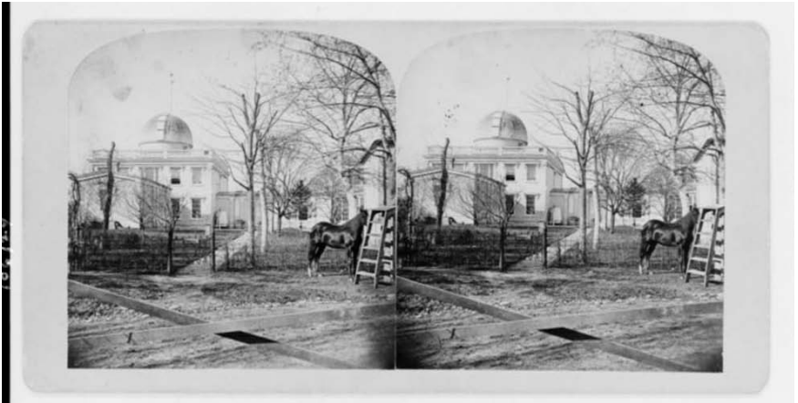
Lincoln and Hay visited the old Naval Observatory before returning to the Soldiers' Home (stereograph circa 1867-1869).