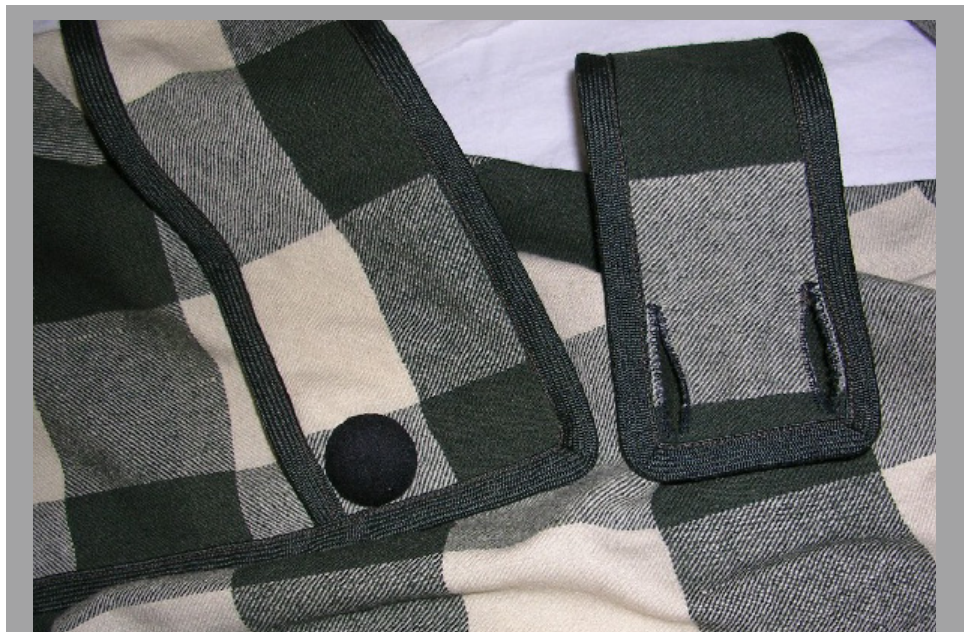
Details on Mary Lincoln's dress.

I even knew exactly Mary Lincoln's waist size — 30 inches — and that was our goal to get Sally Field's weight up to fit the size of the wrapper dress. This particular original dress was a woven check and basically what we did was print the weave on comparable wool from the north of England. The waist might have been thirty inches, but the skirt hem was a whopping 150 inches, with panels inserted. The dress was just absolutely amazing and seeing the brilliant and handstitched detail inside — the binding was black but the actual check color was a dark forest green, which gives a slight