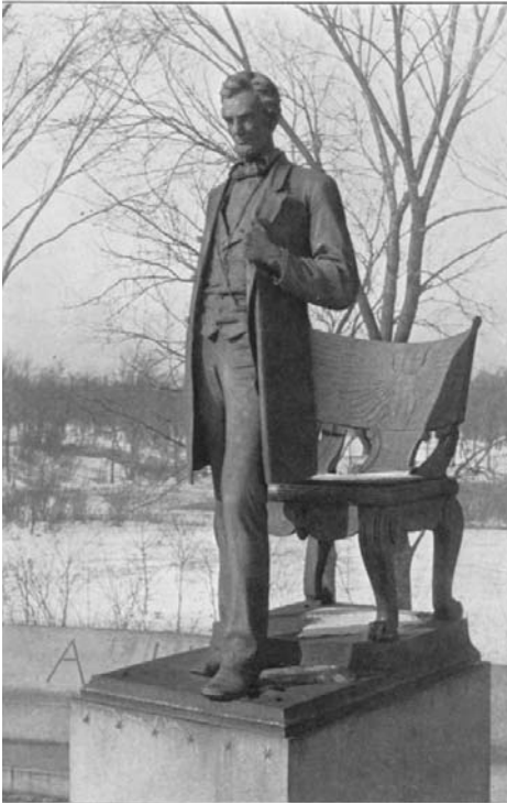
Saint Gaudens, Standing Lincoln . Chicago From Kenyon Cox's Artist and Public , 1914

The bowed head is reminiscent of Saint Gaudens's Standing Lincoln , but the position of the hands was the result of considerable effort on French's part. If the hands were lying relaxed on the arms of the chair or were tightly clasped in Lincoln's lap, we would interpret Lincoln's mood quite differently.