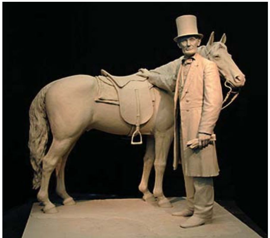
Clay Model of Statue for President Lincoln's Cottage by StudioEIS