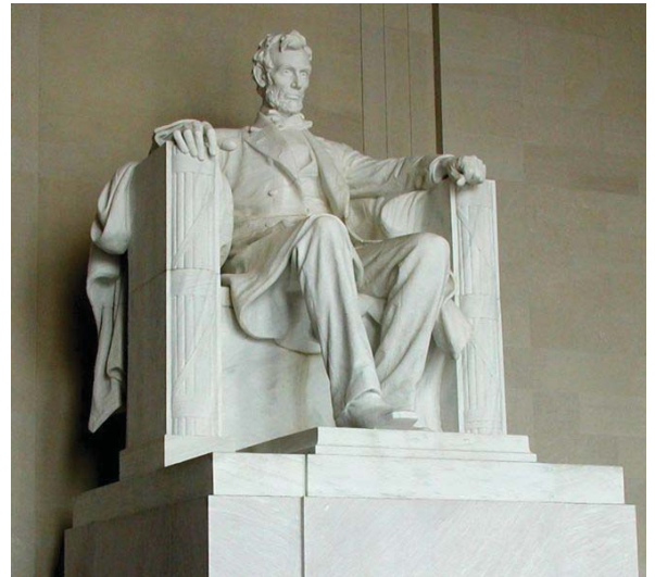
Daniel Chester French, Lincoln, Lincoln Memorial, Washington, D.C.