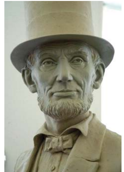
Lincoln for Lincoln's Cottage by StudioEIS

Their Lincoln is also meticulously accurate in its details. To create it StudioEIS's staff did a phenomenal amount of research into Lincoln's physical appearance, including the study of dozens of photographs, sculptures, and paintings. They even measured Lincoln's surviving clothing, including the size of his hat. All this detail is employed to present a facet of Lincoln that we seldom consider. Looking at a few previous versions of Lincoln is the easiest way to grasp how unusual StudioEIS' Lincoln is.