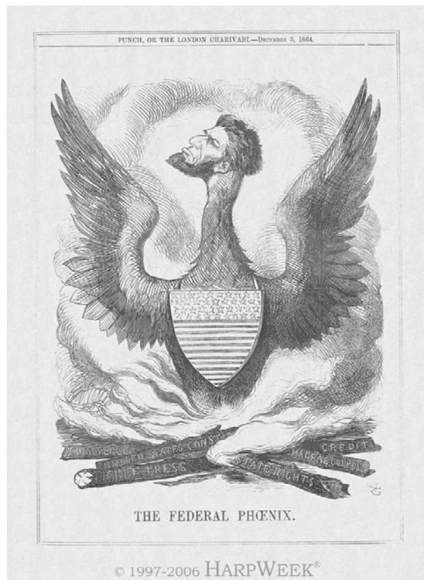
In this 1864 cartoon, Lincoln is mockingly portrayed as a “Federal Phoenix” rising up from the ashes of burnt logs “United States Constitution,” “Commerce,” “Free Press,” “States Rights,” “Credit” and “Habeas Corpus.”

In another example of the influence of the Commentaries , the Pennsylvania legislature passed a law in 1861 forbidding, among other things, the dissuasion of enlistments or the encouragement of desertion from the army.