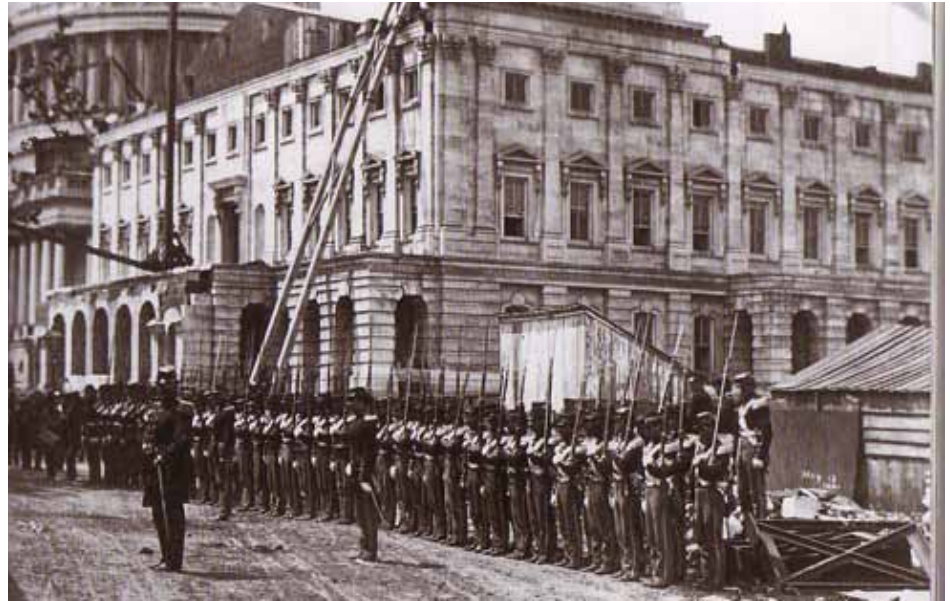
Civil War troops, 1861.

“Quartered in the White House, the Capitol, the Treasury, and the Patent Office, in the Georgetown seminary, and in tents at various points in the city, including the White House south lawn, the soldiers—untrained volunteers in uniform, really—filled the barrooms, the hotel lounges, streets, squares and every other