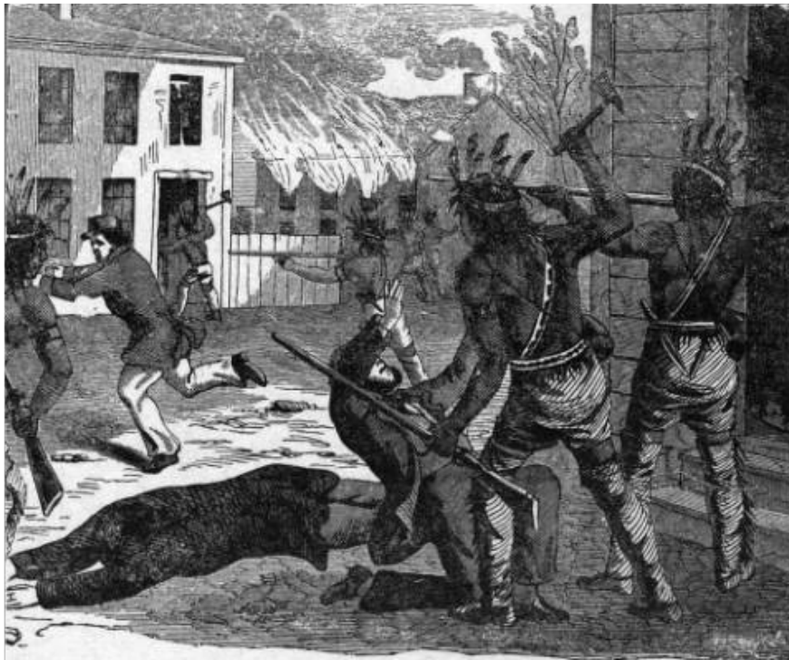
"Massacre of Minnesota settlers."

August 21, Minnesota Governor Alexander Ramsey telegraphed Secretary of War Edwin Stanton that the "Sioux Indians on our western border have risen, and are murdering men, women, and children." 4 When the uprising broke out, Lincoln's secretary John Nicolay and U.S. Commissioner of Indian Affairs William P. Dole were both in Minnesota to negotiate a treaty with the Chippewa. On August 27 they and Minnesota Senator Morton S. Wilkinson sent a joint telegram to President