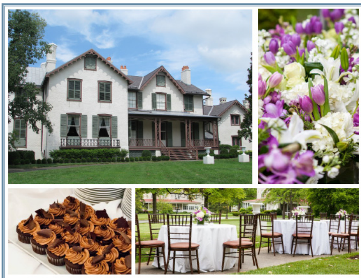
PRESIDENT LINCOLN'S COTTAGE AT THE SOLDIERS' HOME

It is with great pleasure that we introduce to you for the first time, Rental Packages for private and corporate events, meetings, and retreats at President Lincoln's Cottage!