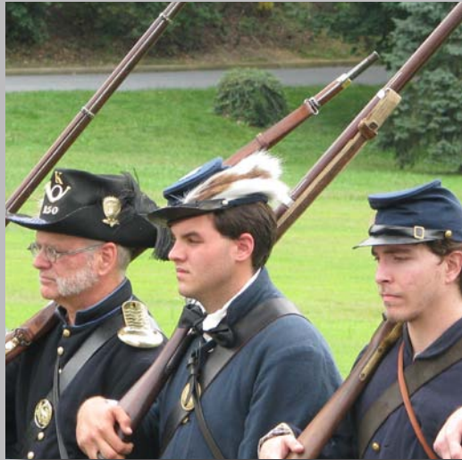
View a Civil War encampment featuring the Bucktails at the 1st Annual Family Day on Saturday, Sept. 29th.