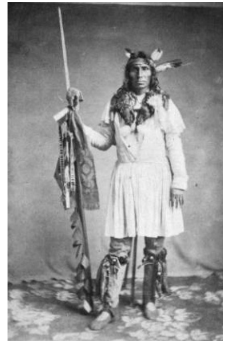
"Ka-ka-kel, Little Crow, a chief of the Mdewakanton Sioux"

"In this that the said _____, Sioux Indian did join with and participate in the murders,